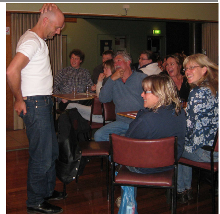
The Sunday Smorgasbord's "Knackers" participating in a game of heads & tails