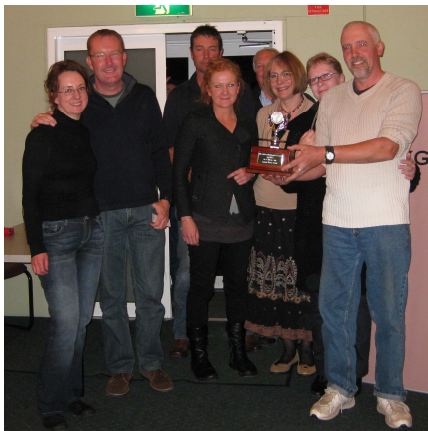
"The Electric Prunes"

A good time was had by all at our annual trivia night held at the New Norfolk Golf Club on Saturday 29 October. Nothing is more enjoyable than seeing adults having fun behaving like children again. The heads and tails and hula hoop games went down a treat and of course there were some trivia questions as well.