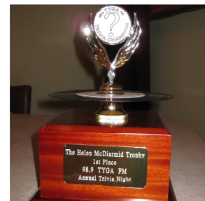
"The Helen McDiarmid Trophy"